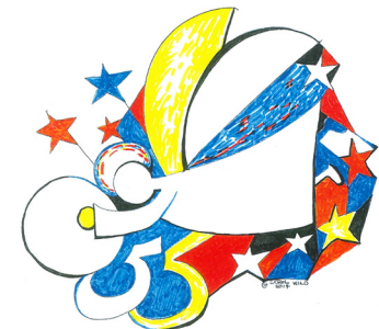
Graphic: Carol Wild used with permission

PHASE III: PLUS Charities needs $150K for capital investment and two year operating expense. JUST TO GET ON THE AIR, $55K is needed!